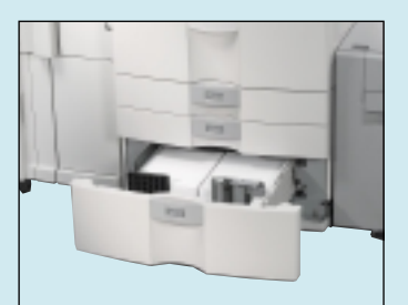
Two 500-sheet adjustable trays and one tandem 2,500-sheet tray are standard.